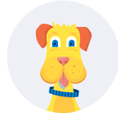
Life-Enhancing Therapeutic Activities