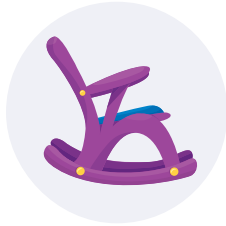
Pediatric Respite Care

Our services are provided at no cost to families thanks to the generous donations and support from our community and beyond.