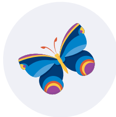
Grief & Bereavement Support