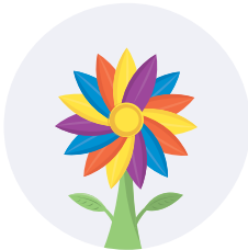
Pediatric End-Of-Life Care